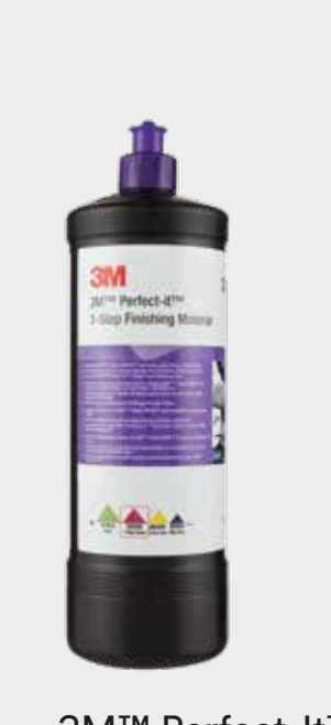
3M™ Perfect-It™ 1-Step Finishing Material