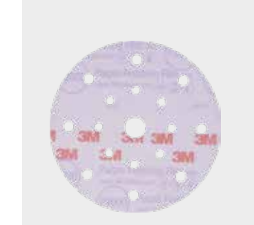
3M™ Hookit™ 260L+

► Sand the area with 3M<sup>™</sup> Hookit<sup>™</sup> Purple Finishing Film Abrasive Disc 260L, grade P1500 - P2000.