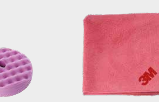
Pink High Performance Ultra Soft Cloth Microfiber