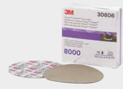
3M™ Trizact™ Fine Finishing Disc 8000