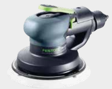
Festool LEX 3 150/3