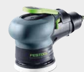
Festool LEX 3 77