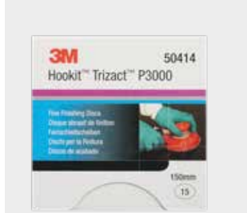
3M™ Trizact™ Fine Finishing Disc 3000

► Refine scratches with 3M<sup>™</sup> Trizact<sup>™</sup> Fine Finishing Disc 443SA, grade 8000, 150 mm on orbital sander.