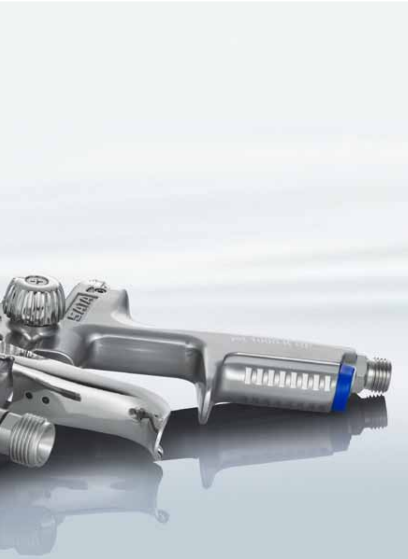
Complementary accessories are available for special applications, such as radiator coating.