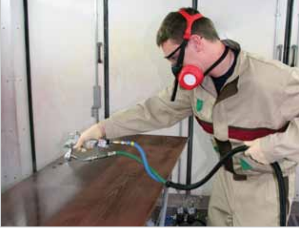
Perfect finishes are achieved with this flexible and versatile spray gun.