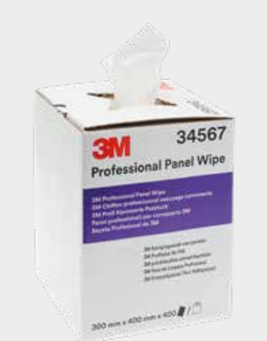
3M™ Professional Panel Wipes

► Degrease the surface using paint company or other recommended product. Always follow the manufacturer's instructions.