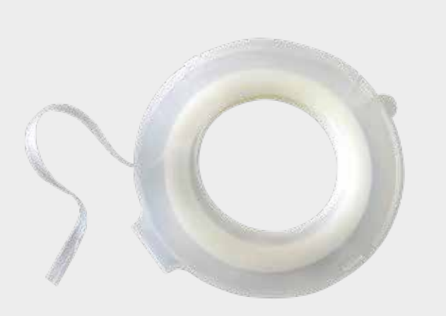
3M™ Smooth Transition Tape

Note: Avoid generating hard edges when primer masking. This generates surface swelling due to the concentration of solvents on the tape edges.