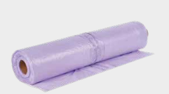
3M<sup>™</sup> Purple Premium PLUS Clear Masking Film 4m x 150m, 5m x 120m, 6m x 120m

► Cover the vehicle as soon as possible, this reduces the possibility of contamination from the surrounding environment.